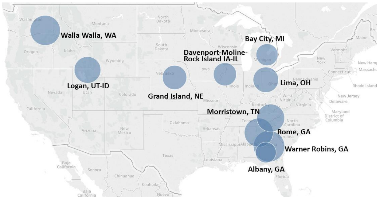
TOP METROS: STUDENTS WITH ASSOCIATE DEGREE OR CERTIFICATE BY POPULATION Total Associate Degrees & Certificates per 100,000 Population Age 18 and over

Source: National Center for Educational Statistics, U.S. Census Bureau ACS Population 18 Years and up, Garner Economics