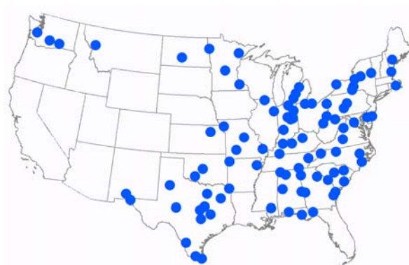
Metros with Year-Over-Year Employment Growth in May 2010